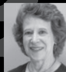
Sherrie S. Bergman Alumni Award for Faculty and Staff