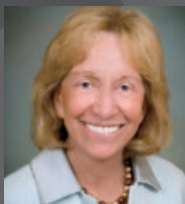
Doris Kearns Goodwin Keynote Speaker

Pulitzer Prize-winning historian Doris Kearns Goodwin will deliver the keynote address at the Reunion Convocation ceremony on Saturday, June 2, 2012.